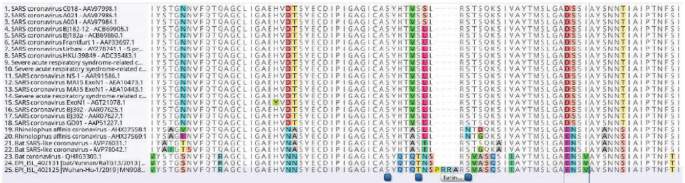
Figure 2 | Acquisition of furin cleavage site and O-linked glycans. The spike protein of 2019-nCoV (bottom) was aligned against the most closely related SARS and SARS-like CoVs. The furin cleavage site is marked in grey with the three adjacent predicted O-linked glycans in blue. Both the furin cleavage site and O-linked glycans are unique to 2019-nCoV and not previously seen in this group of viruses.

An interesting feature of 2019-nCoV is a predicted furin cleavage site in the spike protein (Figure 2). In addition to the furin cleavage site (RRAR), a leading P is also inserted so the fully inserted sequence becomes PRRA (Figure 2). A proline in this position is predicted to create three flanking O-linked glycans at S673, T678, and S686. A furin site has never before been observed in the lineage B betacoronaviruses and is a unique feature of 2019-nCoV. Some human betacoronaviruses, including HCoV-HKU1 (lineage A) have furin cleavage sites (typically RRKR), although not in such an optimal position.