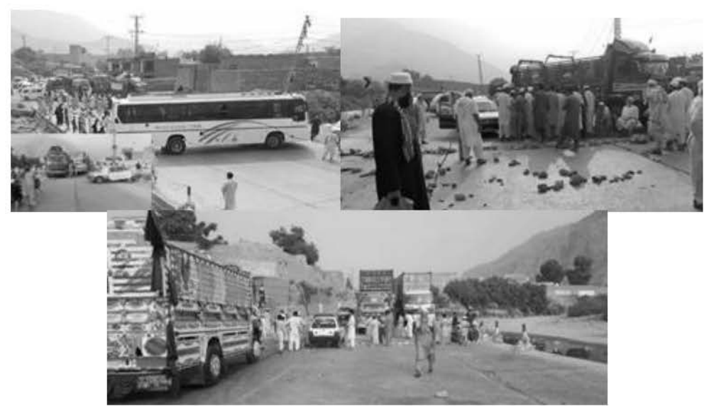
Protests and Blockade of Torkham Highway near Landi Kotal on July 27

6. (U) Truckers Protest, Block Torkham Road in Khyber: Transporter groups involved in Afghanistan-Pakistan trade protested July 27, temporarily blocking the Torkham highway in Landi Kotal leading to the Torkham border crossing. The protests were directed at local Khyber District police and Khyber Pakhtunkhwa (KP) officials, asking them to address alleged bribery and extortion at truck parking lots in Bara, an area 30 miles from Torkham where trucks are directed to park and wait for their turn to cross the border. Contacts estimate 800-1,000 trucks are waiting in these Bara parking lots – a result of backlogs caused when COVID-19 restrictions and clearing procedures slowed border crossing traffic. KP transporter contacts claim the COVID-related border crossing restrictions contributed to the creation of the Bara parking lots and alleged illegal pressure on the truckers, some of whom have been stranded for days with rotting cargo. KP officials reopened the highway late on July 27 and assured the transporter groups the Bara truck lots would be closed and cleared of trucks within 48 hours. (NOTE: In earlier discussions with contacts, KP and national officials had promised to build secure parking lots for the backlogged trucks closer than Bara to the actual border crossing. END NOTE. (b)(6)