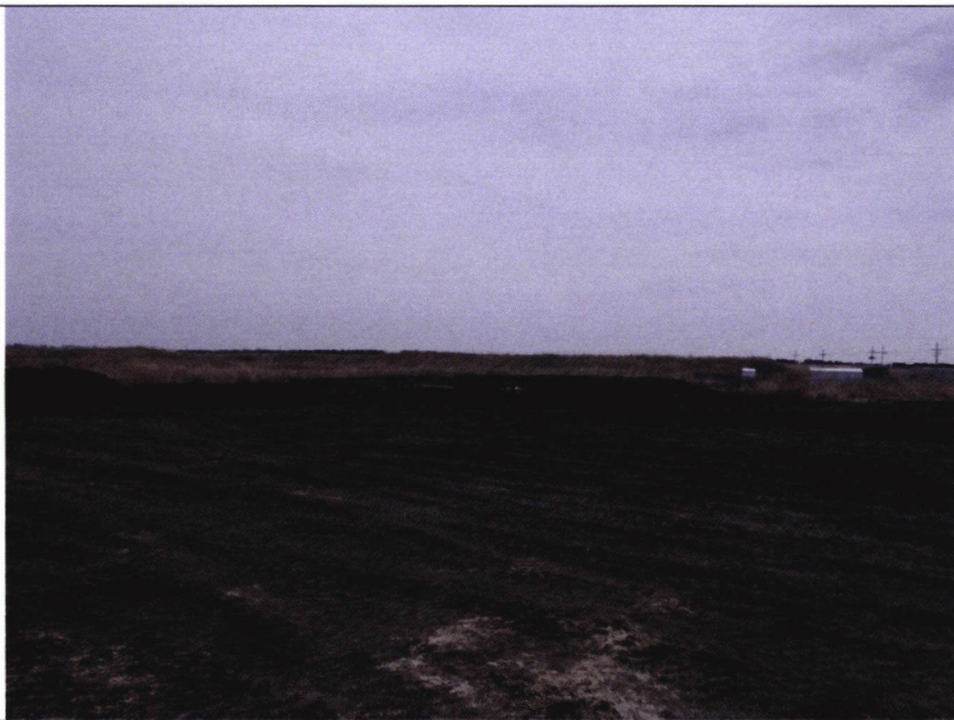
Photograph 3 Date: April 12, 2018 Camera: Nikon Coolpix L810 IIS# 84069, IWM Permit # NE0204447 NEC# 041018-AB-1328 Subject: AltEn, LLC Site Investigation