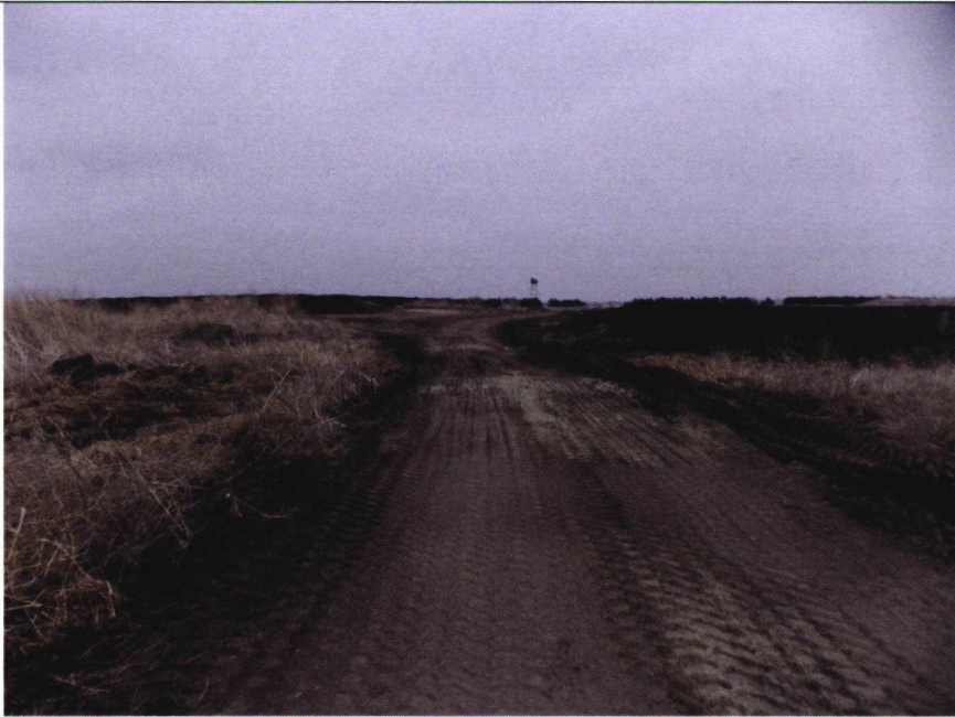
Photograph 5 Date: April 12, 2018 Photographer: Jason Holsten Camera: Nikon Coolpix L810 IIS# 84069, IWM Permit # NE0204447 NEC# 041018-AB-1328 Subject: AltEn, LLC Site Investigation

Looking north, photograph showing additional material being stored on site. Mr. Stewart said the material located in the upper left corner of the photograph was newer material.