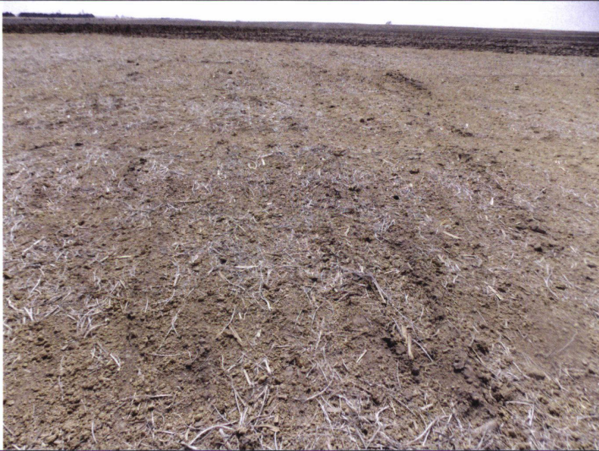
Photograph 13 Date: April 12, 2018 Camera: Nikon Coolpix L810 IIS# 84069, IWM Permit # NE0204447 NEC# 041018-AB-1328 Subject: AltEn, LLC Site Investigation

Photograph taken to show the area of field "B" where the material had not yet been incorporated (disked) into the soil. Note the material which appears as small clumps of soil.