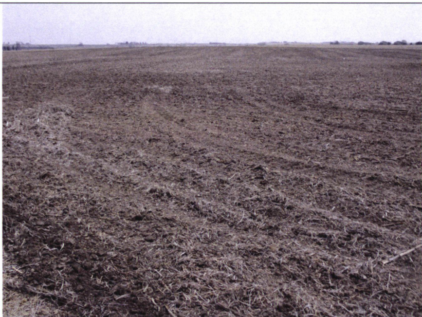
Photograph 9 Date: April 12, 2018 Camera: Nikon Coolpix L810 IIS# 84069, IWM Permit # NE0204447 NEC# 041018-AB-1328 Subject: AltEn, LLC Site Investigation