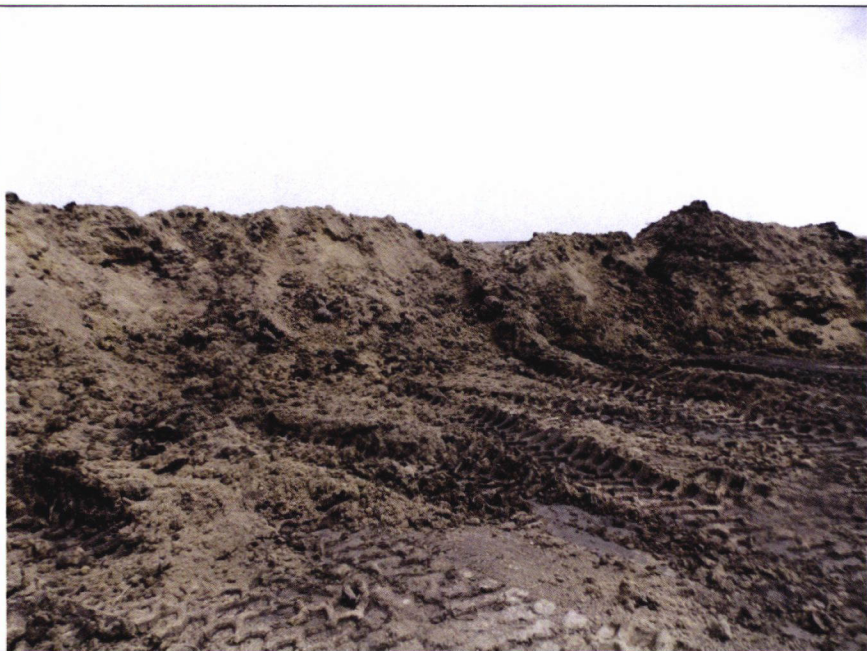
Photograph 4 Date: April 12, 2018 Camera: Nikon Coolpix L810 IIS# 84069, IWM Permit # NE0204447 NEC# 041018-AB-1328 Subject: AltEn, LLC Site Investigation

Looking northeast, photograph showing material that has settled over time. Mr. Stewart explained that over time the material settles and is not as voluminous as before.