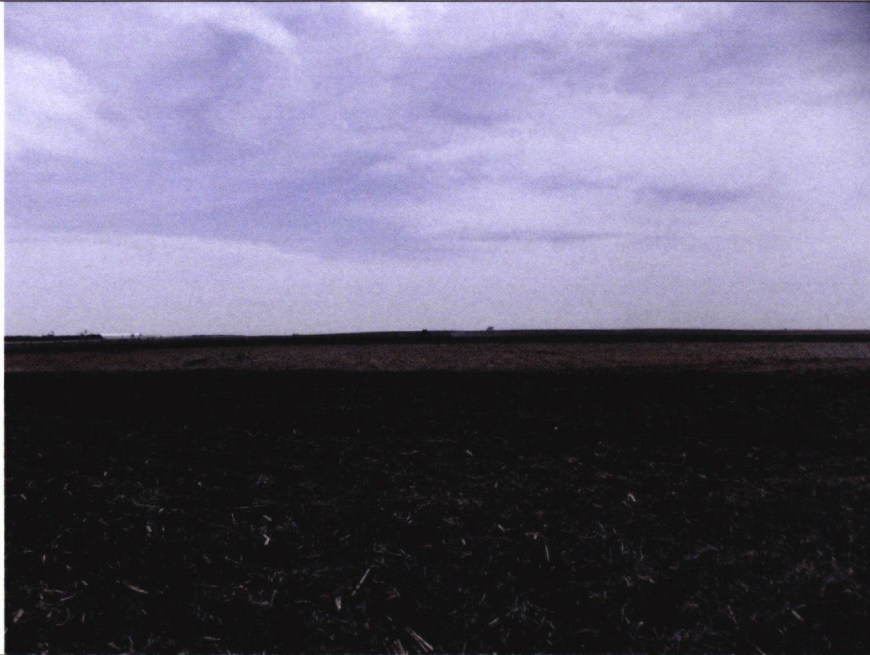
Photograph 11 Date: April 12, 2018 Camera: Nikon Coolpix L810 IIS# 84069, IWM Permit # NE0204447 NEC# 041018-AB-1328 Subject: AltEn, LLC Site Investigation

Looking south, photograph taken to show a farmer incorporating (disking) the material into the soil on field "B."