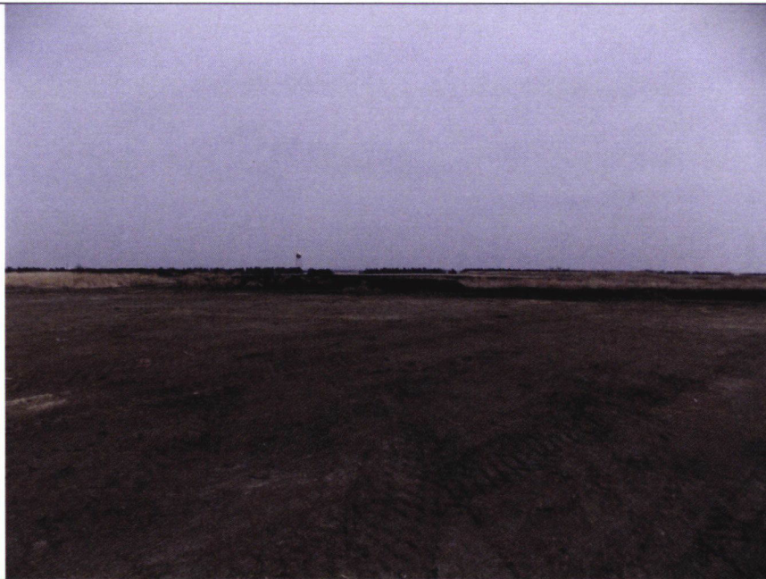
Photograph 2 Date: April 12, 2018 Photographer: Jason Holsten Camera: Nikon Coolpix L810 IIS# 84069, IWM Permit # NE0204447 NEC# 041018-AB-1328 Subject: AltEn, LLC Site Investigation

Note: WDG will be referred to as "material" in the narrative portion of the remaining photographs.