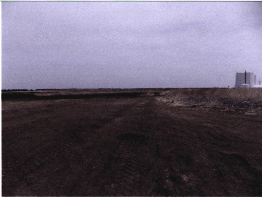
Photograph 1 Date: April 12, 2018 Camera: Nikon Coolpix L810 IIS# 84069, IWM Permit # NE0204447 NEC# 041018-AB-1328 Subject: AltEn, LLC Site Investigation

Looking east, photograph showing an area located north of the office building where wet distiller's grain (WDG) was previously being stored. Photograph taken to show progress made by facility in removing the material.