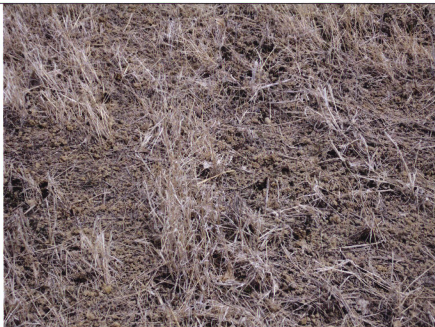
Photograph 8 Date: April 12, 2018 Camera: Nikon Coolpix L810 IIS# 84069, IWM Permit # NE0204447 NEC# 041018-AB-1328 Subject: AltEn, LLC Site Investigation

Looking east northeast, photograph of the field identified as "A" on the Google Earth image (Attachment V).