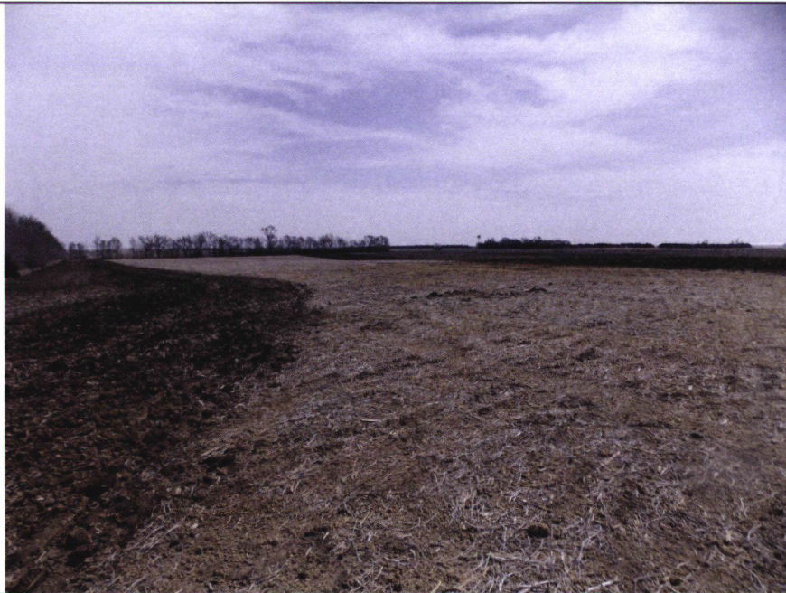
Photograph 14 Date: April 12, 2018 Photographer: Jason Holsten Camera: Nikon Coolpix L810 IIS# 84069, IWM Permit # NE0204447 NEC# 041018-AB-1328 Subject: AltEn, LLC Site Investigation

Photograph taken to show the area of field "B" where the material had not yet been incorporated (disked) into the soil. Note the material which appears as small clumps of soil.