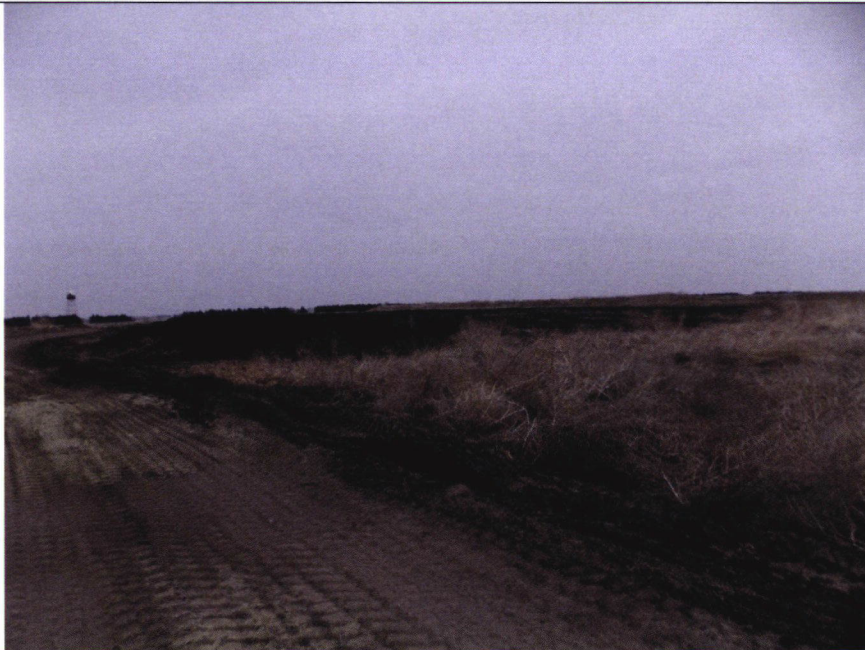
Photograph 6 Date: April 12, 2018 Camera: Nikon Coolpix L810 IIS# 84069, IWM Permit # NE0204447 NEC# 041018-AB-1328 Subject: AltEn, LLC Site Investigation

Looking north, photograph showing additional material being stored on site. Mr. Stewart said the material located in the upper left corner of the photograph was newer material.