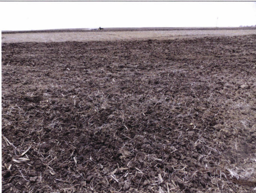
Photograph 12 Date: April 12, 2018 Photographer: Jason Holsten Camera: Nikon Coolpix L810 IIS# 84069, IWM Permit # NE0204447 NEC# 041018-AB-1328 Subject: AltEn, LLC Site Investigation

Looking south, photograph taken to show a farmer incorporating (disking) the material into the soil on field "B."