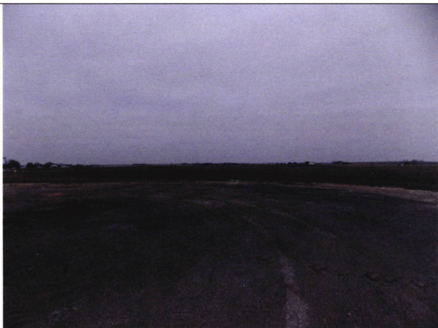
Photograph 7 Date: April 12, 2018 Camera: Nikon Coolpix L810 IIS# 84069, IWM Permit # NE0204447 NEC# 041018-AB-1328 Subject: AltEn, LLC Site Investigation

Looking east northeast, photograph of the field identified as "A" on the Google Earth image (Attachment V).