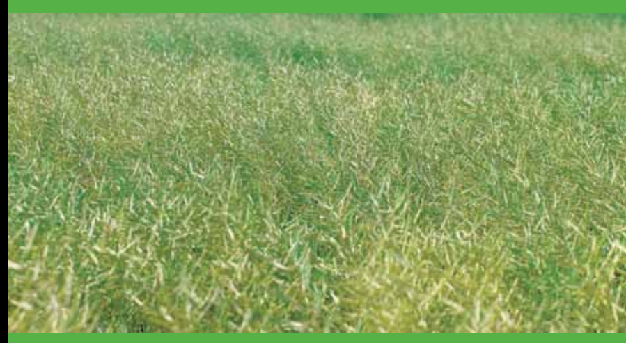
Canola crop at preharvest application stage. Apply when canola has 30% or less moisture content – typically 7 to 14 days before harvest.

In Argentine-type canola, application closer to 30% seed moisture content will allow sufficient time for optimum weed control before swathing is required to prevent shattering. Wait 3 full days (72 hours) after application before swathing to allow thorough translocation for long-term weed control. The crop may be harvested (straight cutting or swath pick-up) 7 days after application.