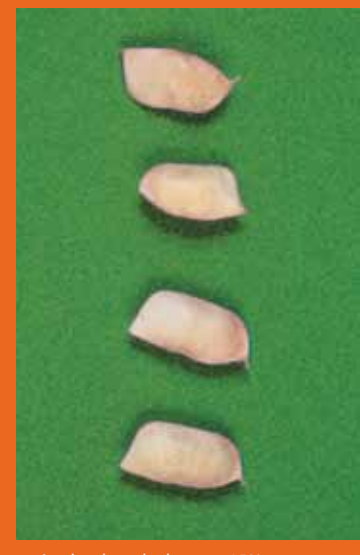
Apply when the bottom 15% of lentil pods are brown and the seeds rattle.