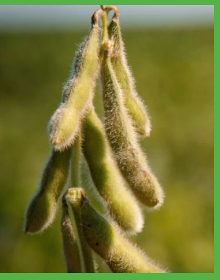
Apply Roundup brand agricultural herbicides when stems are green to brown and there is 80% to 90% leaf drop.

Apply when the crop has 30% or less moisture content. At this stage, stems are green to brown; pod tissue is dry and brown in appearance; 80% to 90% leaf drop. Applications closer to the 30% moisture content stage will result in greater harvest benefits.