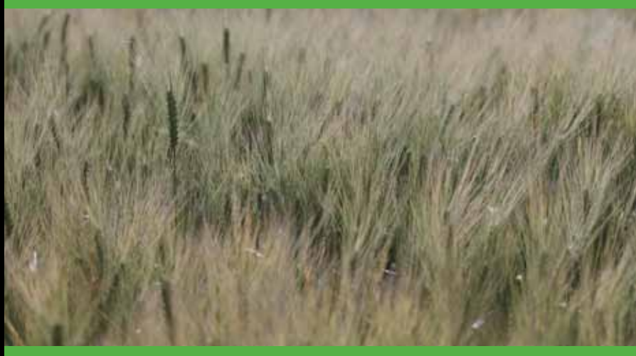
Feed barley at proper stage for preharvest application.

Apply when the crop has 30% or less moisture content – the hard dough stage. At this stage, a thumbnail impression will remain on the kernel. This stage is typically 3 to 5 days before you would normally swath. Application closer to the 30% moisture content stage will result in greater harvest management benefits, such as more uniform maturity and earlier harvest.