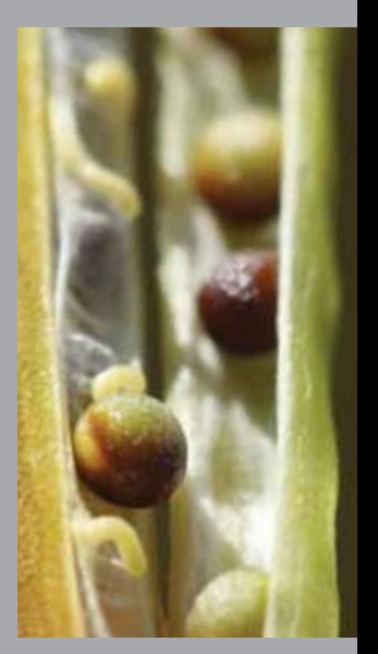
Apply when pods are green to yellow and most seeds are yellowish to brownish.

If the crop is a Genuity<sup>®</sup> Roundup Ready<sup>®</sup> canola variety, the preharvest application will not provide adequate drydown of the crop. However, weed control is uncompromised and harvest management benefits will also accrue from green weed drydown.