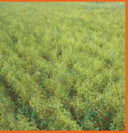
Lentils at proper stage for preharvest application.

Apply when the crop has 30% or less moisture. At this stage, the lowermost pods (bottom 15%) are brown and the seeds rattle. This is the stage you would normally swath. Applications closer to the 30% moisture content stage will result in more harvest management benefits.