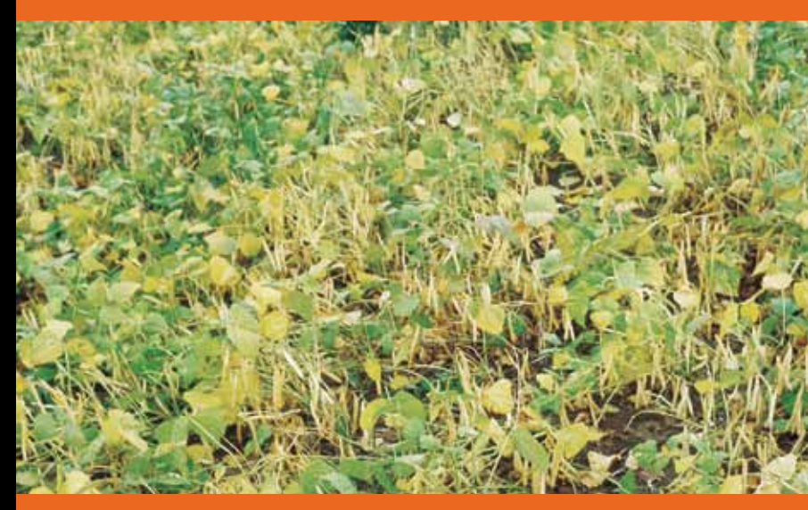
Apply Roundup<sup>®</sup> brand agricultural herbicides when at least 80% of the pods are yellow to light brown.

Apply when the crop has 30% or less moisture content. At this stage, a majority of the pods (80% or more) are yellow to light brown in colour. The plants will also be at 80% to 90% leaf drop of original leaves. Pod colour is a better indicator than percent leaf drop because dry bean plants may begin to grow new leaves late in the fall. Applications closer to the 30% moisture content stage will result in greater harvest benefits.