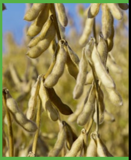
Late applications can be made and still achieve good perennial weed control.