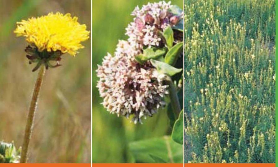
Dandelion – a growing problem

To control dandelion, milkweed and toadflax, weeds should be actively growing and at the bud to bloom stage of growth. This stage of growth typically occurs around the same time the crop is ready to spray. In crops with heavy crop canopies such as canola, use higher water volume (7 to 10 g.p.a.) to ensure maximum coverage.