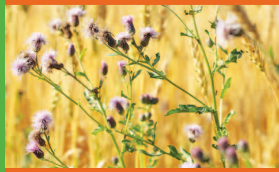
The best time to control Canada thistle - at or beyond the bud stage.

If you have used a Canada thistle herbicide in the spring, ensure that adequate regrowth is present and that the thistle plants are actively growing. If in doubt, talk to your local retailer, Monsanto Representative, or call Monsanto's CustomCare<sup>®</sup> line at 1 (800) 667-4944.