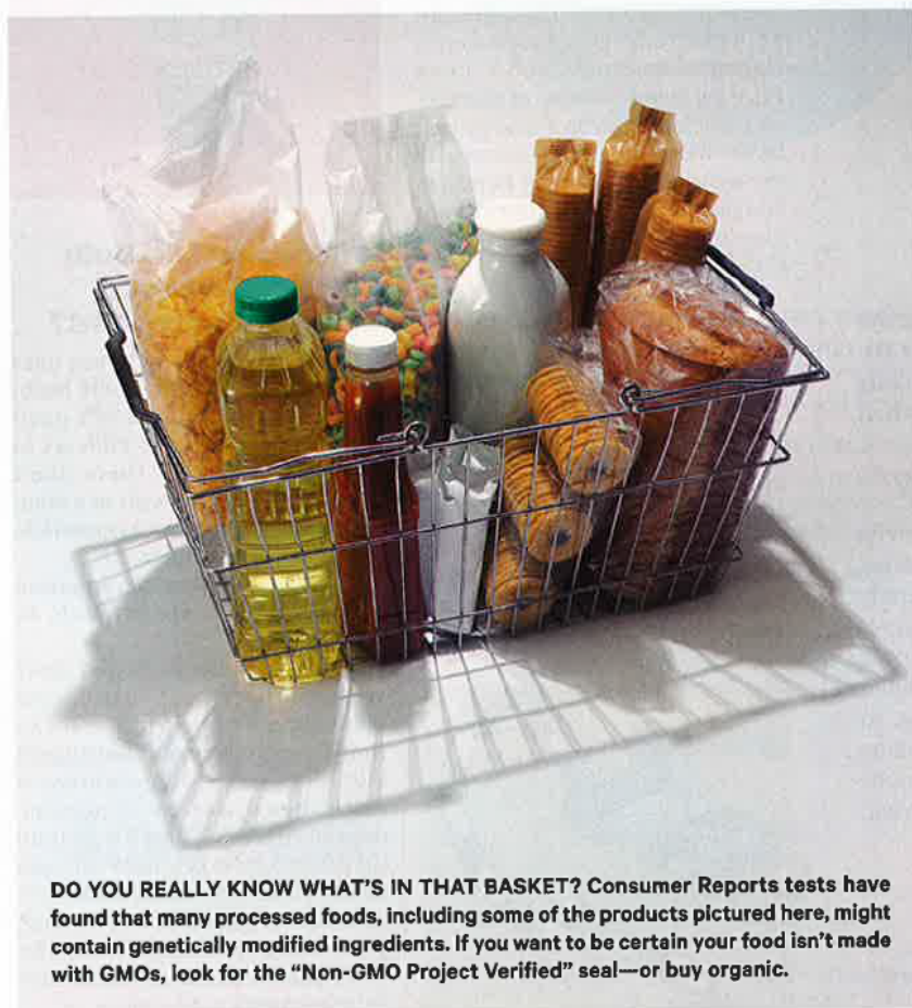
DO YOU REALLY KNOW WHAT'S IN THAT BASKET? Consumer Reports tests have found that many processed foods, including some of the products pictured here, might contain genetically modified ingredients. If you want to be certain your food isn't made with GMOs, look for the "Non-GMO Project Verified" seal—or buy organic.

Those who support using GMOs point out that Americans have been eating foods containing them for more than 15 years